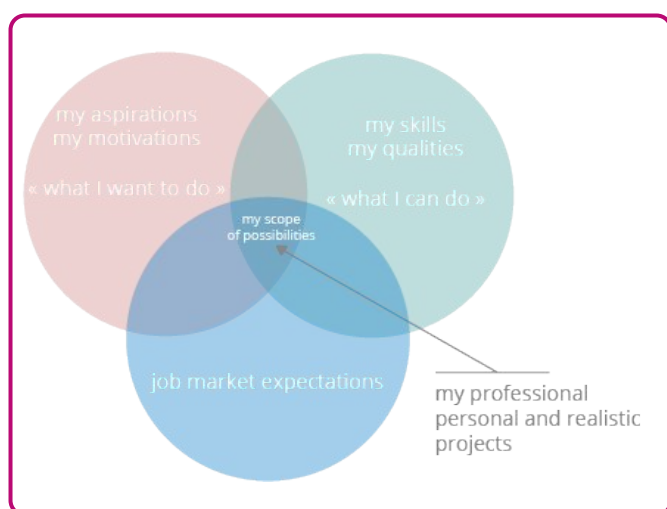
The 3 spheres of the professional plan

Studies conducted by our Laboratory of Interdisciplinary studies on the Doctorate (LID) allow us to produce data and develop tools used in our training programs, optimizing our ability to support the career paths of researchers and meet the needs of research personnel.